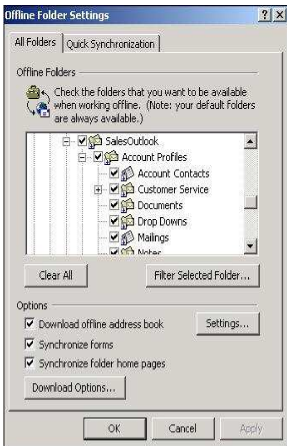
Figure 3 – SalesOutlook Offline Folder Settings

Besides being a set of CRM tools that are used within the Microsoft Outlook and Office environments (as opposed to a separate application that may or may not integrate with Outlook and/or Office), SalesOutlook further distinguishes itself because it uses the built-in Microsoft synchronisation technology that makes information available for use offline, when a connection to the Internet is not available.